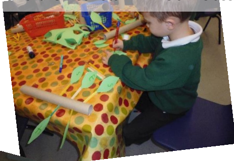
Jack and the Beanstalk in Robin class

Sainsbury's Active Kids Eat well • Move well • Live well