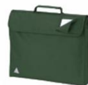
Classic Book Bag