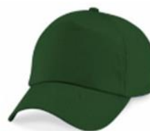
Baseball Cap - Junior