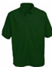
Polo Shirt - Poly/Cotton fabric Classic by Blue Max