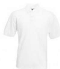
Polo Shirt by Fruit of the Loom