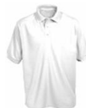
Polo Shirt by Jerzees