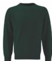
Sweatshirt - Crew Neck by Jerzees