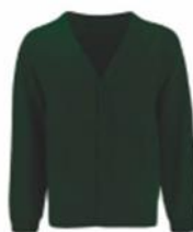
Sweat Cardigan by Jerzees