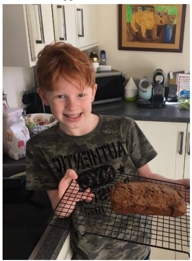
From the team at Meldreth Primary School...we wish you all well!

Meldreth Primary School.....Learning Together for Life