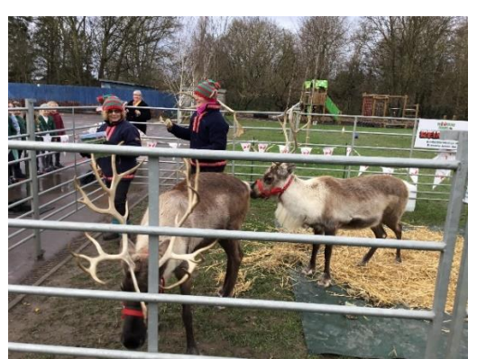
From the team at Meldreth Primary School...we wish you all a happy and heathy Christmas!