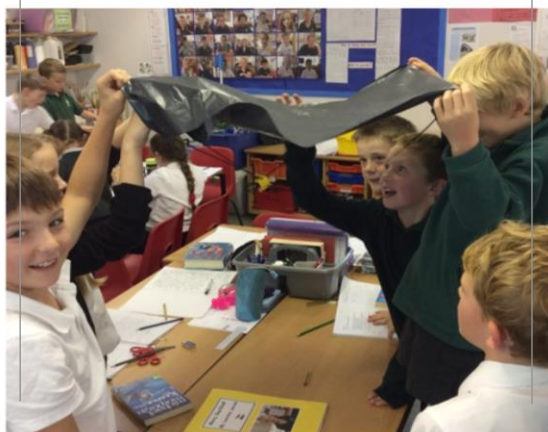
Forces in action in Chaffinch class this week!

Poppies and other merchandise, including wristbands , will be available in school after half term for a donation of between £1 or £2 . They will be taken round school daily make sure your child has the relevant money if they wish to get one. The poppies are the 'stick on' kind so they are safe for our children.