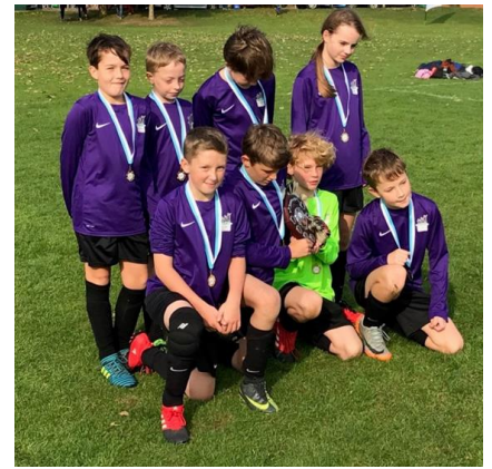
Woodpecker class tennis coaching this week