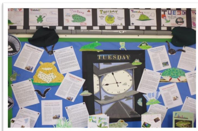
Woodpecker class work on the book ' Tuesday ' by David Wiesner