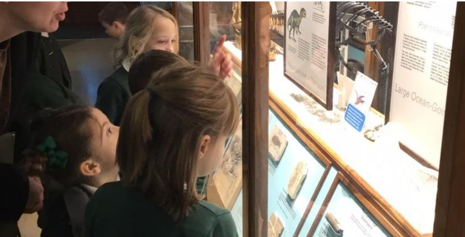
Wren Class at the Sedgewick Museum

This week, we have welcomed our new team of Peer Mediators to the school playground – this is a very prestigious role that has a high profile in the school. Our peer mediators work towards empowering their peers to resolve minor conflicts and disputes in a peaceful, fair and calm manner.