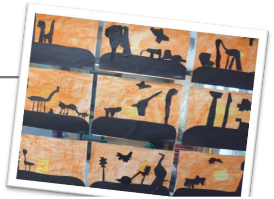
Jay class's safari landscapes ... showing their superb cutting skills!

It is hard to believe that we are so close to the end of what has been a wonderful year of " Learning Together for Life ". It has been wonderful to watch the children's successes throughout the year and I am sure you are as proud of their achievements as we are. A huge well done to all families for your support in improving your children's attendance this year. Regular attendance ensures that your child fulfils their potential. We have just exceeded our whole school target of 95% attendance, thank you for your support this year in this important matter.