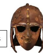
Sutton Hoo Helmet