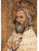
Edward the confessor