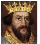
William the conqueror