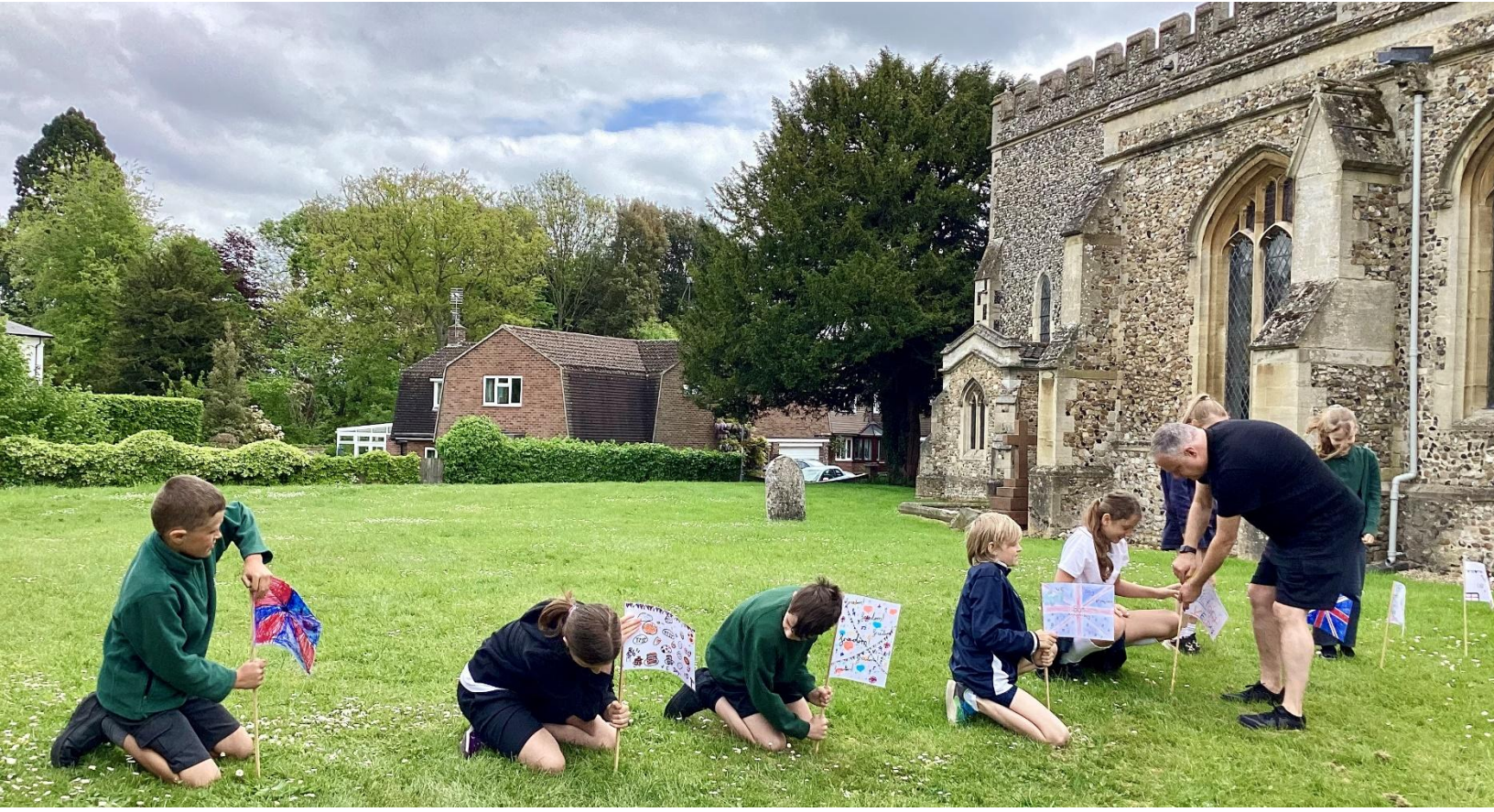
School Councillors planting winning VE Day 80 Celebration flags at Melbourn Church

This week, the Governing Boards of Hauxton Primary and Meldreth Primary and Preschool are seeking your views on an important proposal, to federate the two schools under a single governing board starting from 1<sup>st</sup> September 2025. The consultation period runs from 7th May to 23<sup>rd</sup> June 2025.