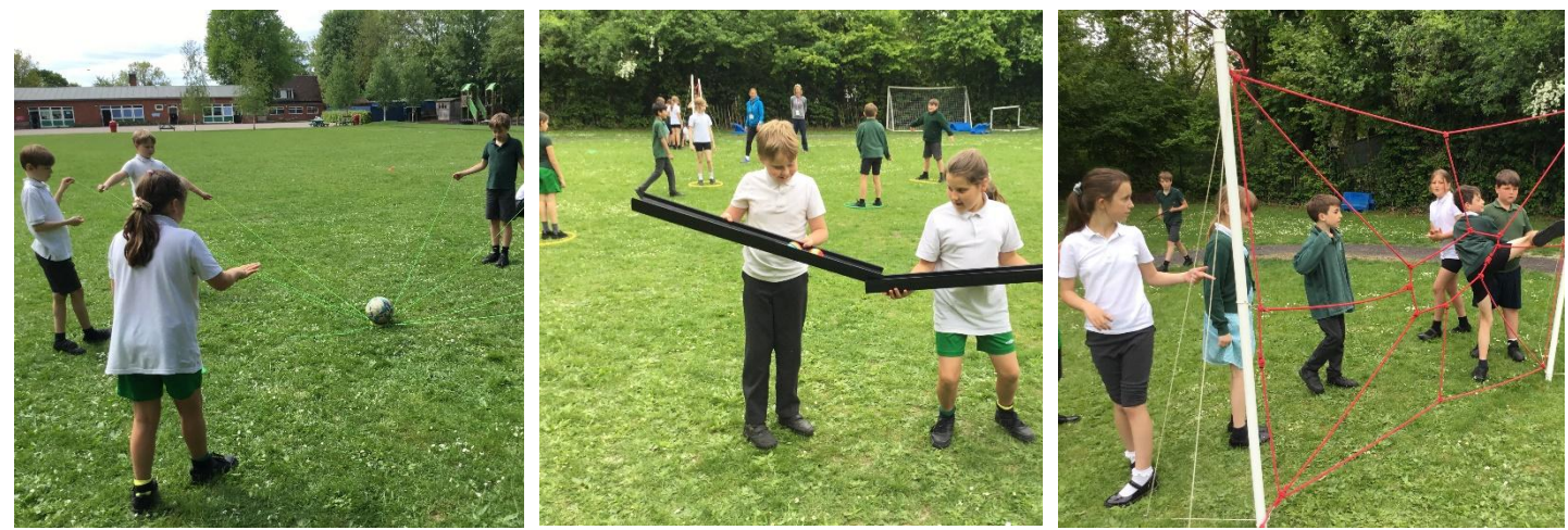
Kestrel Class Teambuilding Workshop