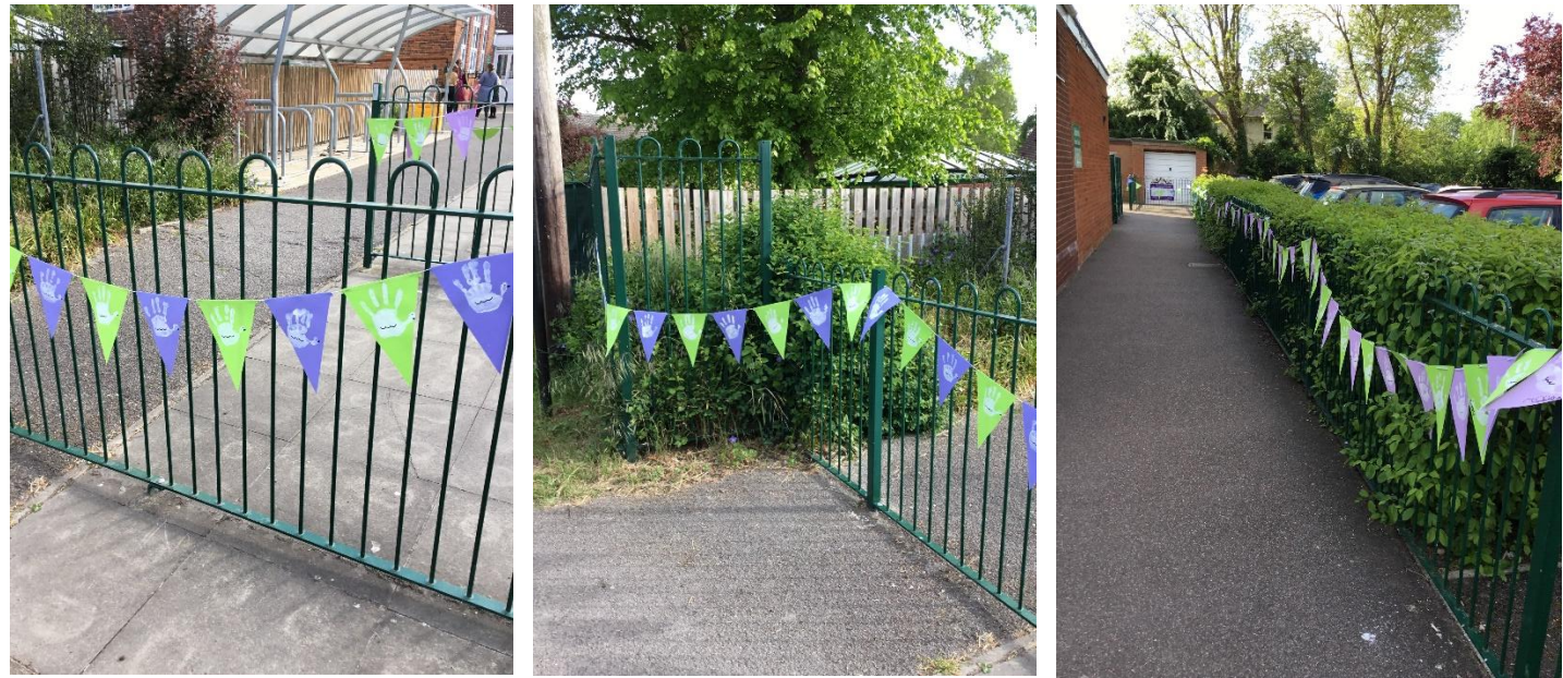
VE Day 80 Bunting Doves of Peace