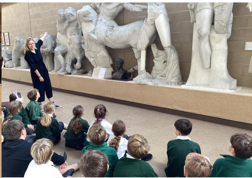
Hawk Class Visit to the Museum of Classical Archaeology

What extraordinary September weather we are enjoying this week, first heavy rain then blazing sun, then rain again all in the space of a few minutes. Another reminder to prepare your child for anything at school. The children have been fabulous remembering their coats even on a sunny morning.