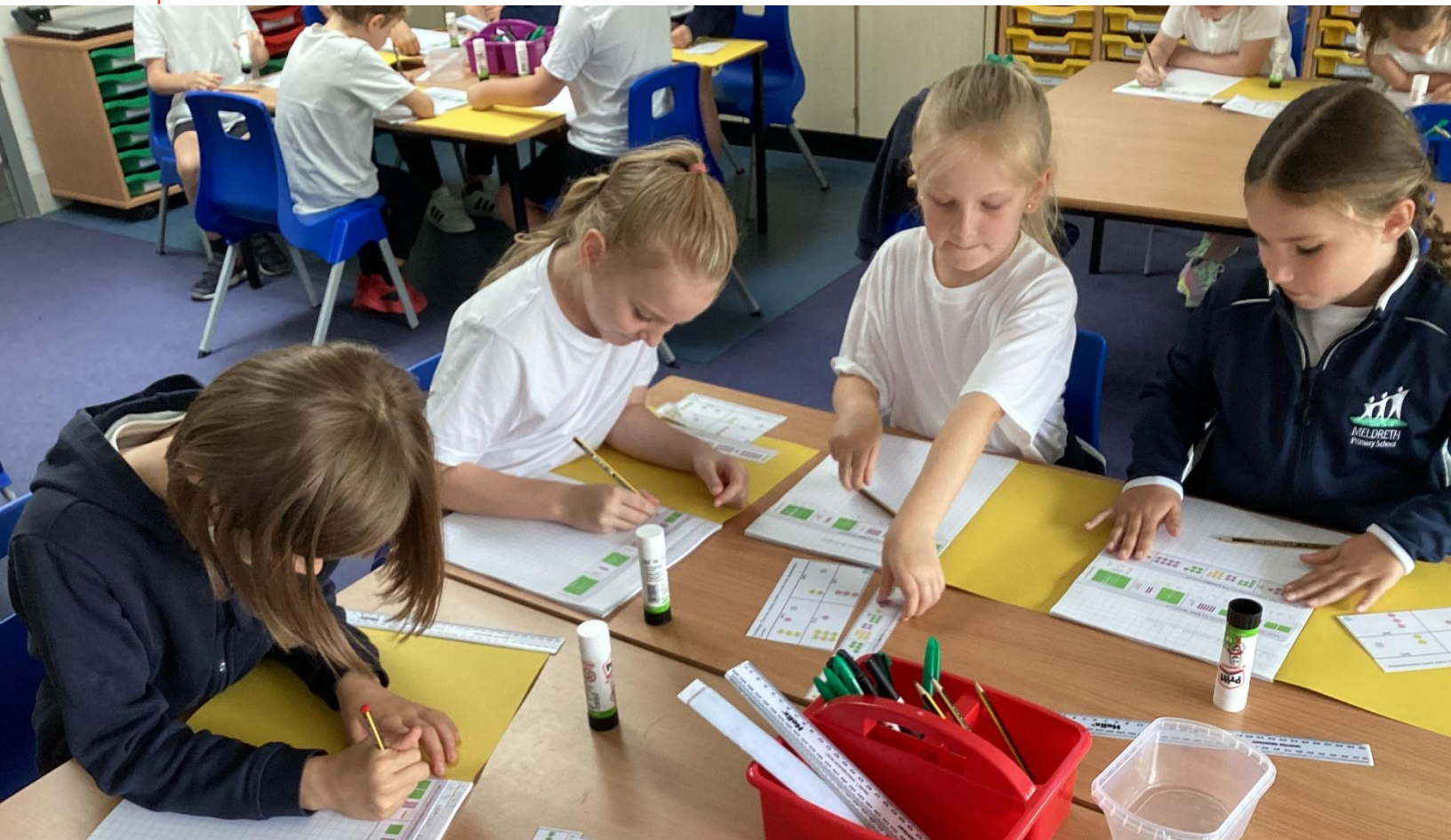
That new book feeling in Kite Class

Welcome Back! It has been absolutely lovely to see everyone returning to school this week, full of smiles and eager to share stories from their summer adventures! The children have come back excited, enthusiastic, and ready to embrace all the new learning opportunities that lie ahead.