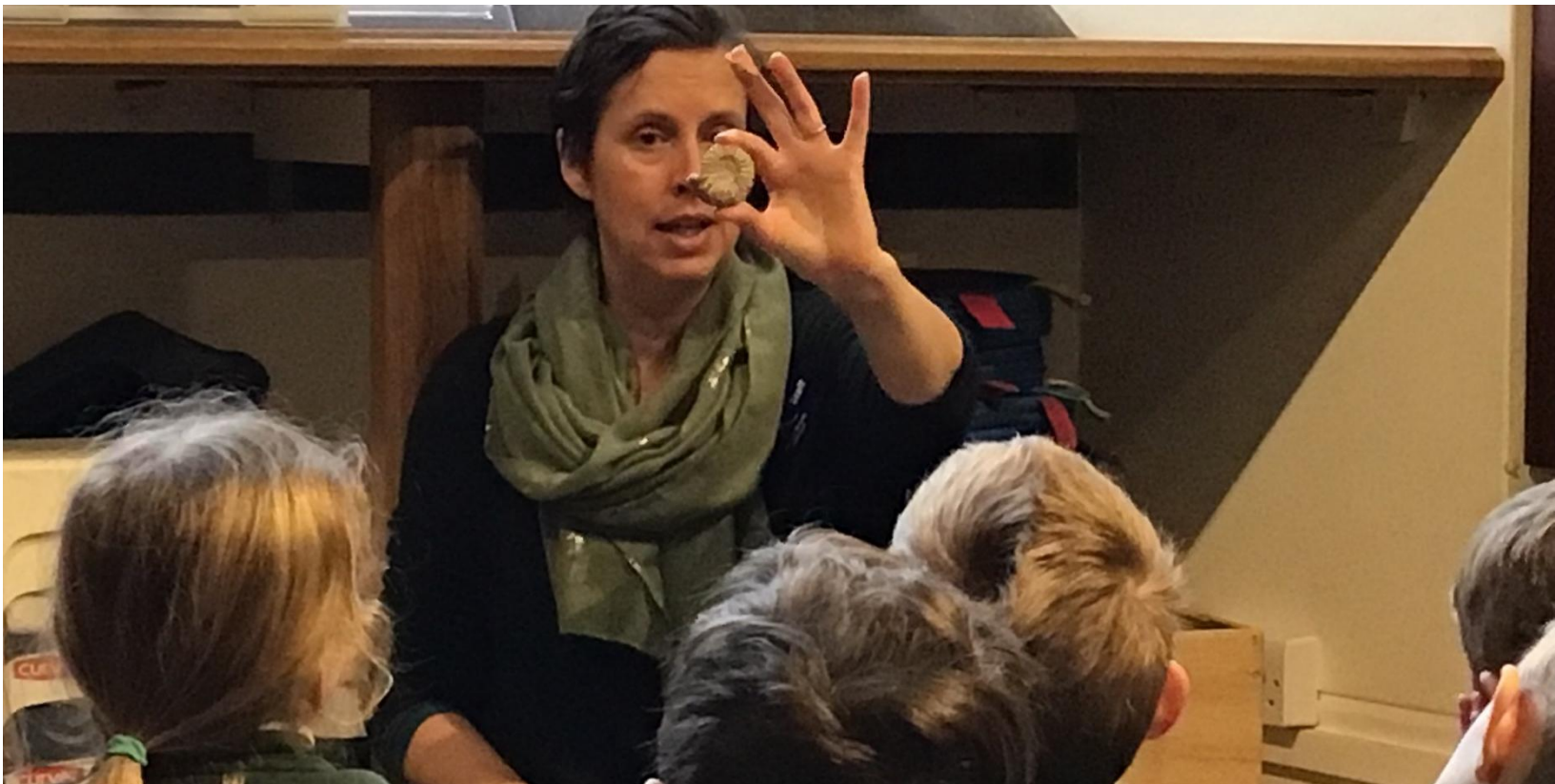
Wren Class Sedgewick Museum Visit

The classrooms have been full of energy this month. Children have been busy building strong learning habits, reconnecting with friends, and setting goals for the term ahead. We are especially proud of the way students have demonstrated our school value of co-operation through kindness and effort.