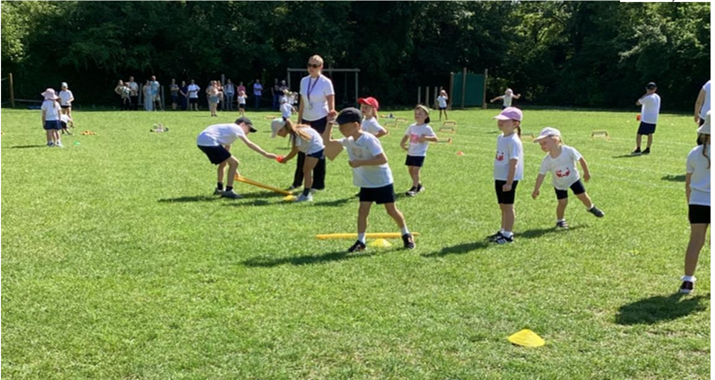
K51 enjoying Sports Day