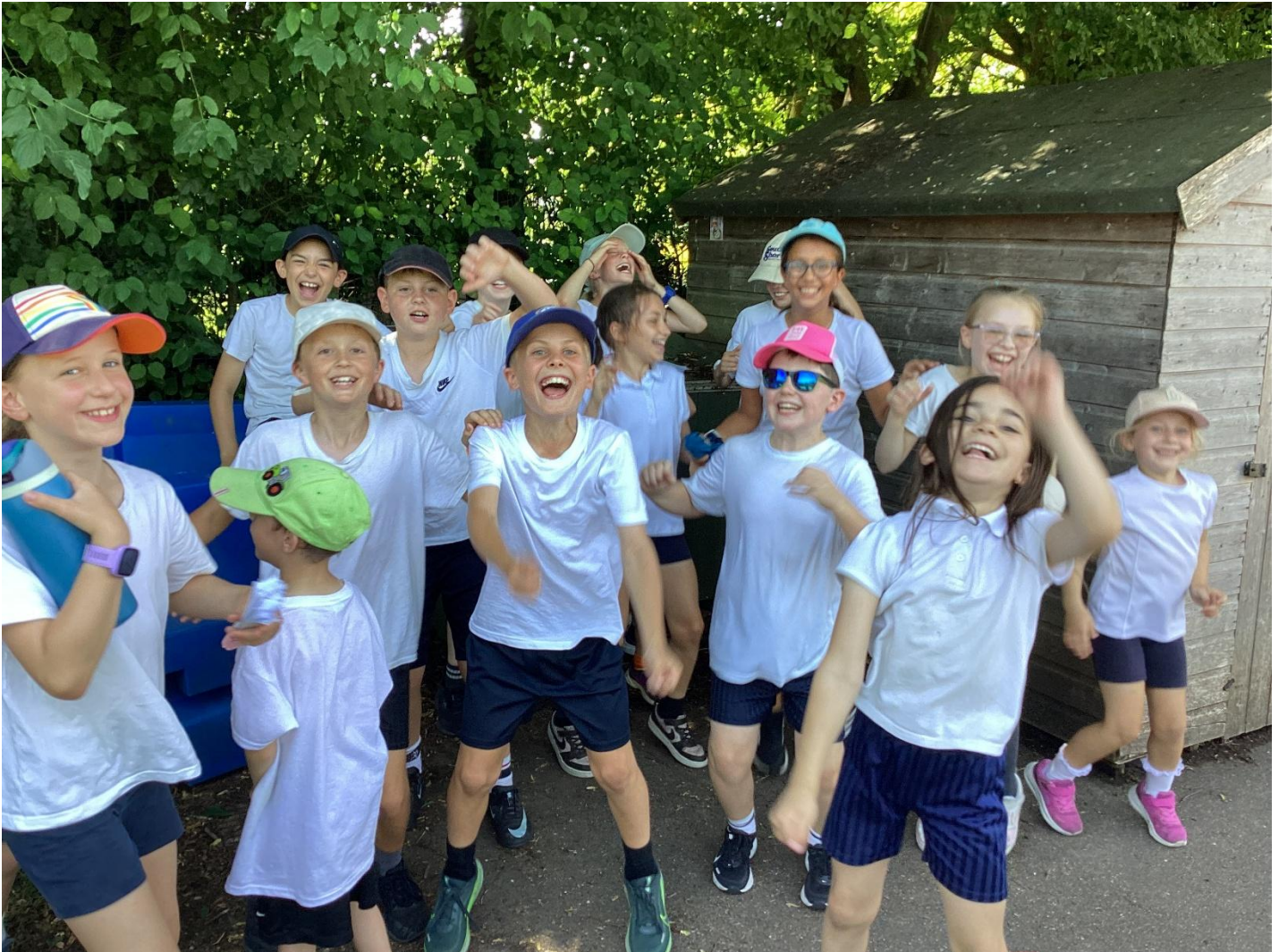
Students enjoying break time in the shade!