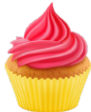
Bake a cupcake