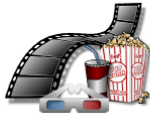
Watch a movie