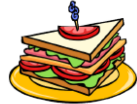
Eating a sandwich