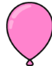
Blow up a balloon