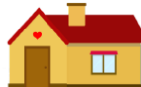
Build a house