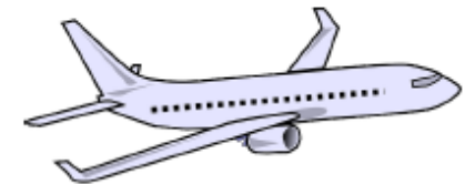
Fly around the world