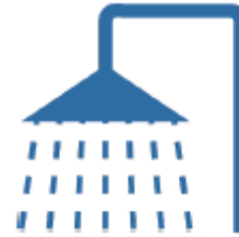
Have a shower