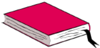
Write a book