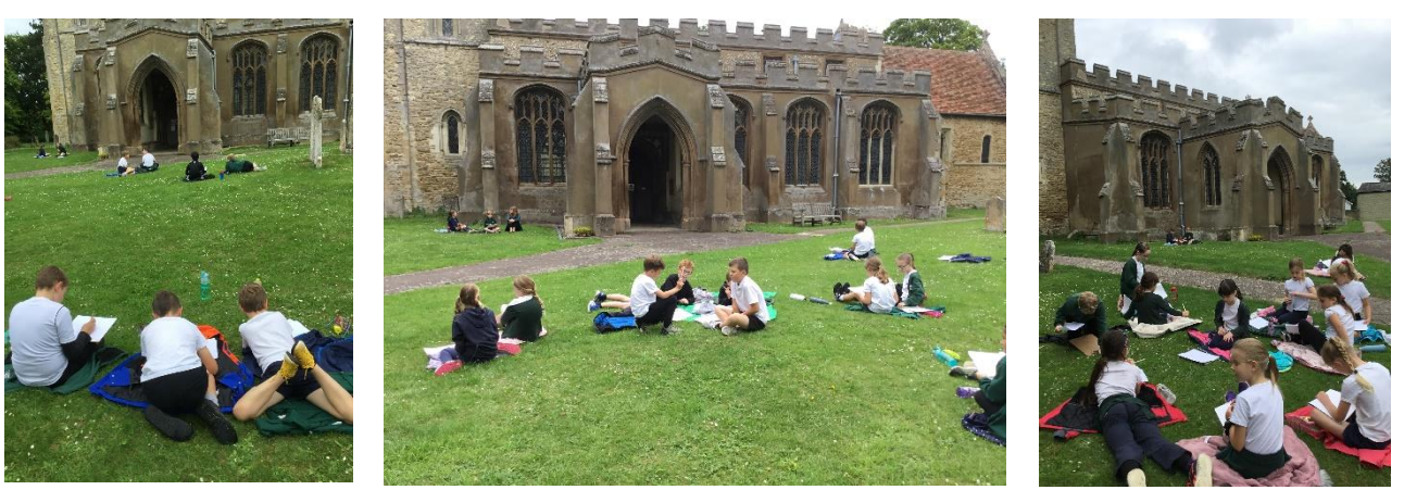
From the Team at Meldreth Primary School – we wish you well!

Moving on Day (classes join their new teachers for the day)