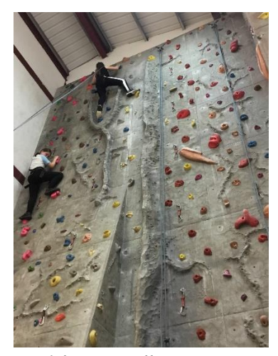
Y6 Adventures Away - From the Team at Meldreth Primary School – we wish you well!