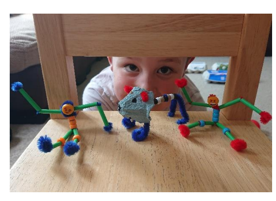
From the team at Meldreth Primary School...we wish you all well!