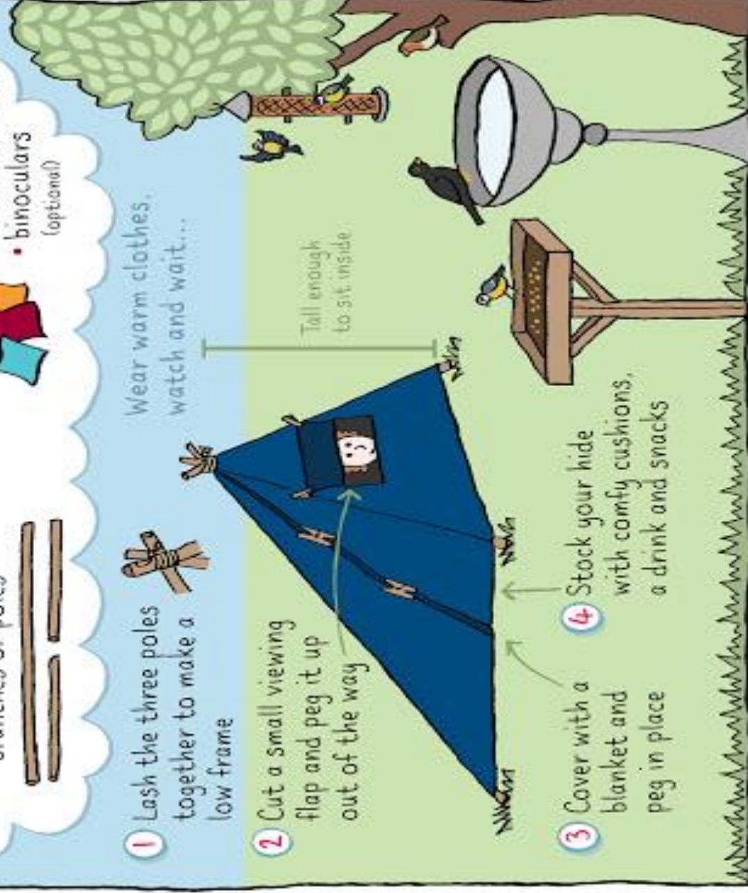
Illustration: Corinne Welch © Copyright Royal Society of Wildlife Trusts 2015

4 Stock your hide with comfy cushions, a drink and snacks