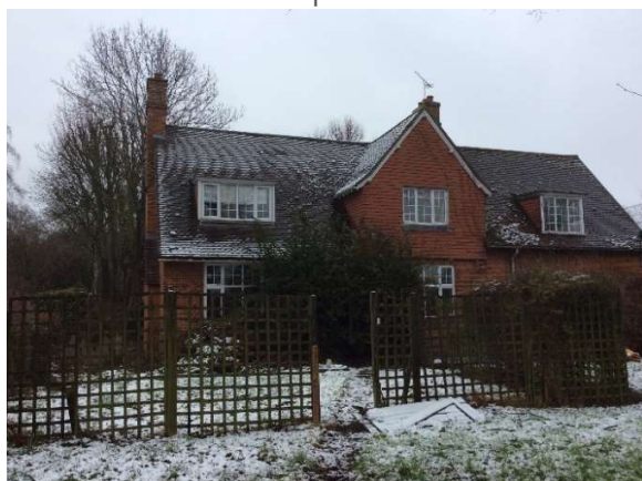
THE SCHOOL HOUSE

We now have good news as we have secured planning permission for the Local Authority to make the necessary changes to the house for it to become an additional 12 place preschool provision for our 2 year olds and space for our popular out of school club "Lookout Club" . Lookout Club provides care for children from 7.40am to 6pm out of school time and we look forward to working with the children to develop and personalise their own space.