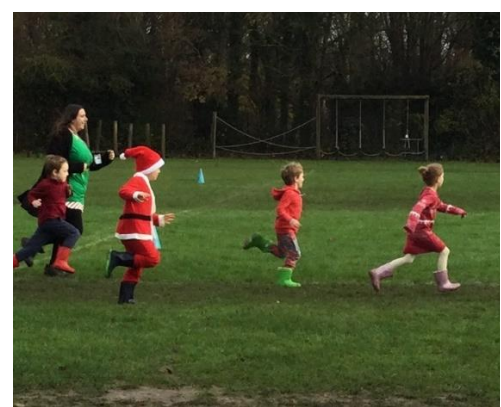
From the team at Meldreth Primary School...we wish you all well!