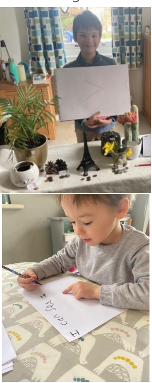
From the team at Meldreth Primary School...we have loved seeing your fabulous home learning!